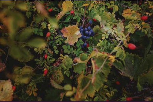
Pais Salvaje: 'Wild Pais' - harvested from completely wild Pais vines in the Maule Valley